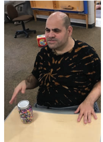
The Adult Development Program had a blast making special Halloween Tie Dye T-shirts!