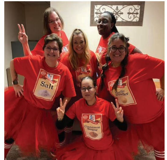
We had a Spice Girls sighting at our Admin Building! Happy Halloween from your Admin Building and Employment Services Team!

The following individuals, organizations, and businesses have donated cash, goods, services, or the use of their facilities from August 2, 2023, through October 20, 2023. We thank all for their generosity. We sincerely hope that we have not inadvertently left anyone off the list. Please contact us if your name or organization has not been recognized.