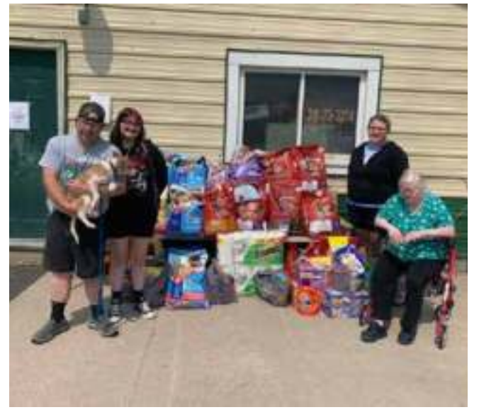
We love giving back and helping our friends at PAW Fort Madison Animal Shelter!