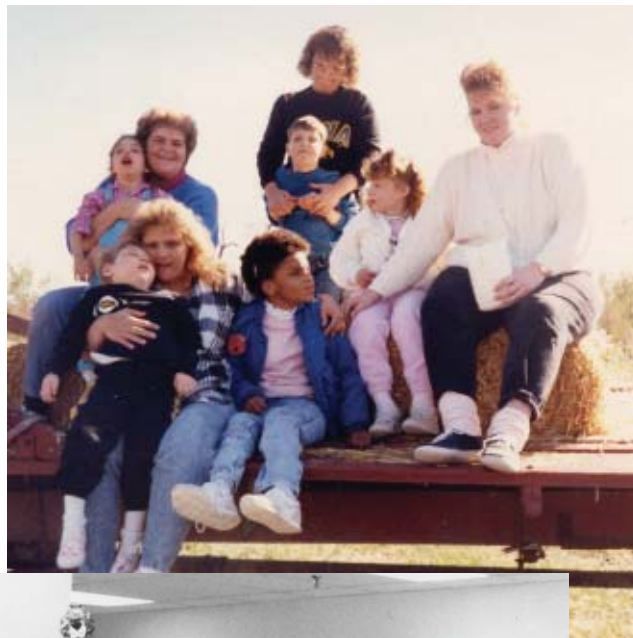
Pictures from the late 1980's: top picture - Ertz Home kids and staff and bottom picture - Brueck Home residents.